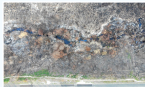
Onrus River 19 February 2019: 07h45